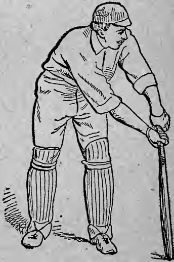
BAD FORWARD PLAY.

and just a little over-pitched ; you must play forward to it. Indeed, in your young days, even if the ball be not over-pitched, but just the right length, you had better play forward. Now, how is this done? Advance the left leg, without losing balance ; keep head and shoulders well over the bat, but erect ; keep the left shoulder turned almost toward mid-off, and move the bat firmly